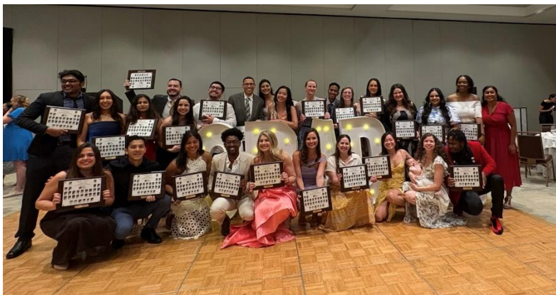
Class of 2025 Pediatric and Medicine-Pediatrics Residents